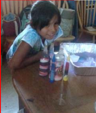
She's proud of her work! She should be.